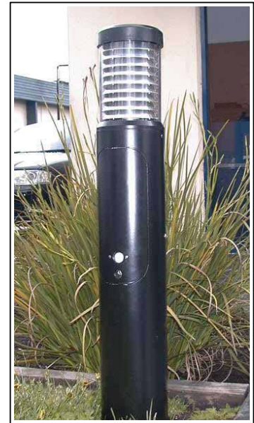
Standard Titan Bollard with PEC