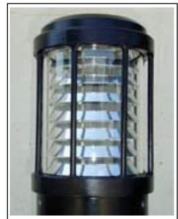
Optional Protective Guard